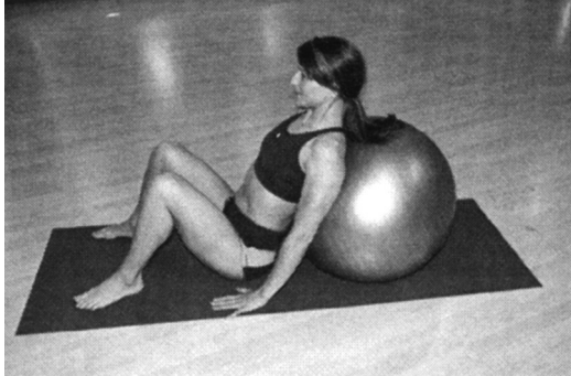
Start (Inhaling and Relaxing)